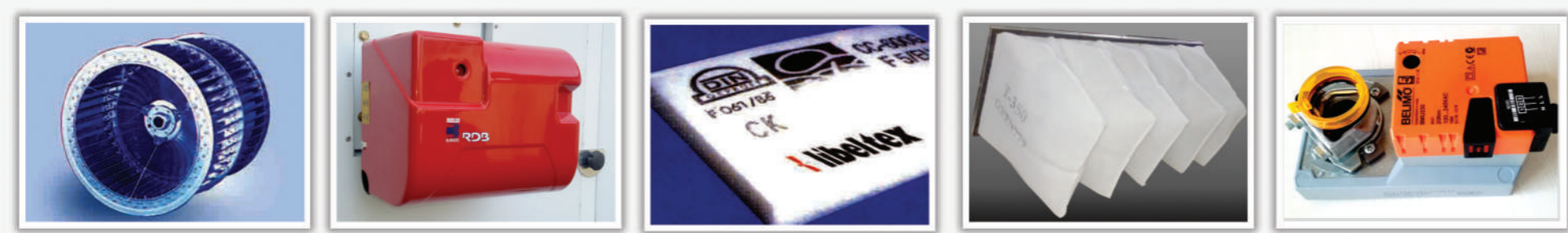
Double Inlet Forward Curved Heavy Duty Fan for High Volume of air and Silent Operation. "amca" certified blowers. Automatic New Generation Imported Diesel Burner Ceiling Filters - Imported, High performance EU-5 grade (DIN 24185) filters with more dust holding capacity Pre Filters - Imported, EU-3 grade to arrest dust upto a level of 10 microns Actuator - Belimo, Switzerland make, for automatic Damper movement