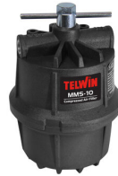
MMS-10 MOISTURE & MIXTURE STOP FILTER 804340